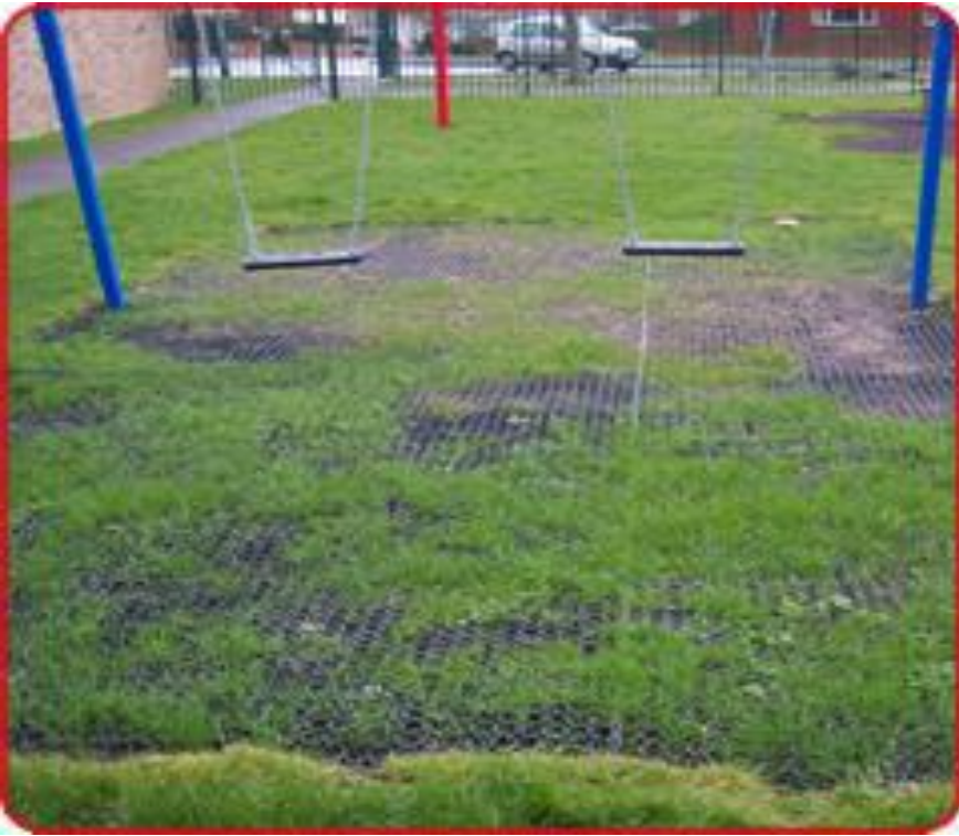
Rolled Turf Product