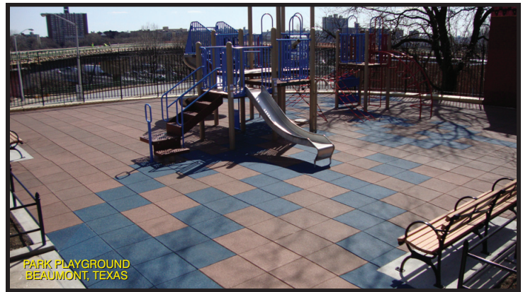
PARK PLAYGROUND BEAUMONT, TEXAS

Installation of this product is placed in the intermediate category. Adhesive may be applied to the base and/or interlocks. Bolt down capabilities (for ground level installations only) are available for extra strength and security. A utility knife or jigsaw can be used for cutting. A straight line and tape measure may also be needed. A trowel and/or caulking gun is required for gluing purposes.